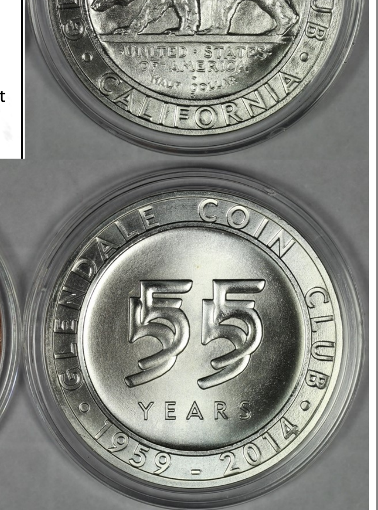
The Glen Coin News

Pick yours up at the April meeting! Final mintage statistics are on the next page.