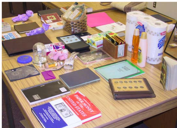
Some examples of the items auctioned