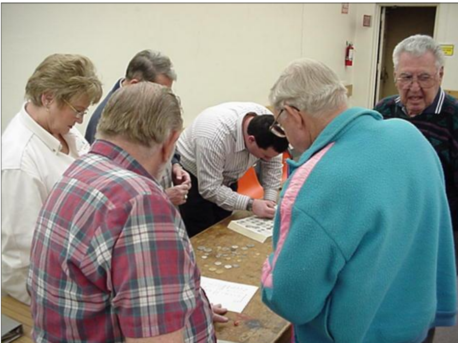
GCCer's crowd around our guest's treasure trove to carefully examine their coins.