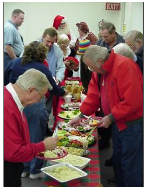
What a spread we enjoyed in December!