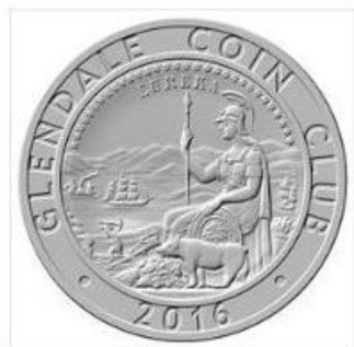
2016 Glendale Coin Club Medal

Thank you to all of you who ordered medals and who have supported the production of these beautiful medals over the past three years!