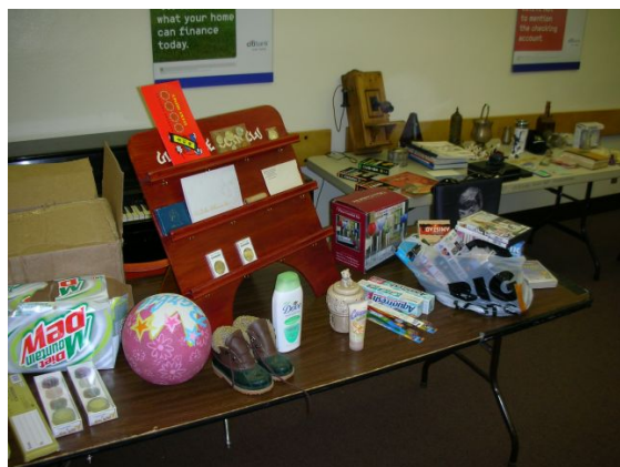
Our treasures brought in over $70